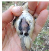
Ex) Provide the evidence of Breeding Stubtail